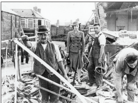
Clearing up in Ilchester Road after the raid of 11th August 1940.