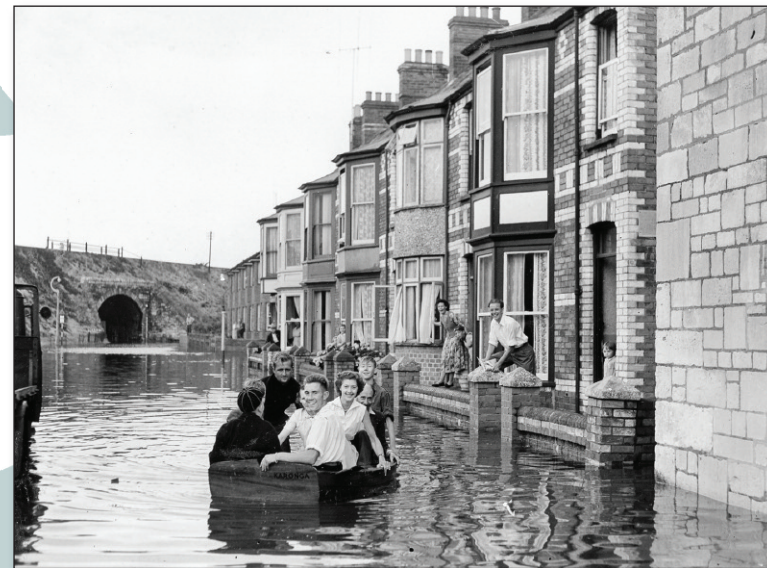
Cheerful locals greet flooded neighbours still awaiting rescue in Newstead Road.