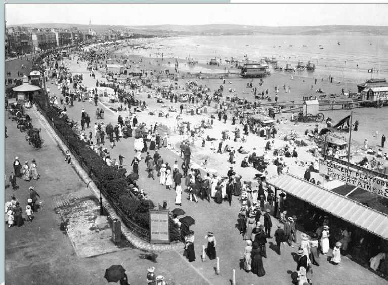
Ballard Brown entertaining on the Sands in the early 1900s at the Sea View Concert Platform.