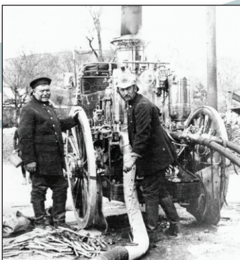
Weymouth Fire Engine at the Sutton Poyntz fire, 18th April 1908.