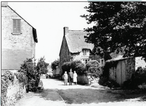
Sutton Poyntz – a view from the 1920s.