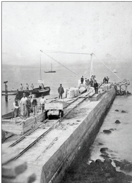
Work in progress – extending the Stone Pier, 1877.